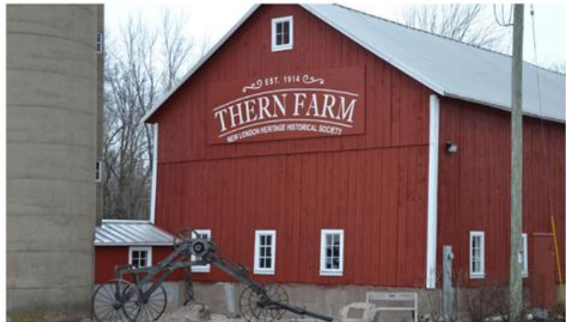
The Thern Farm has been nominated to be listed in National Register of Historic Places. If such recognition is awarded, it would be the first place in New London to receive that honor.

This past July, Thern Farm started the exciting process of seeking a nomination to the National Register of Historic Places. Thern Farm was previously considered in both 1988 and 1997, for listing in the National Register of Historic Places as the historic site of the New London Fairgrounds. However, it was rejected because the physical characteristics of the fair some of which included a grandstand, racetrack, and gatekeeper's lodge were gone.