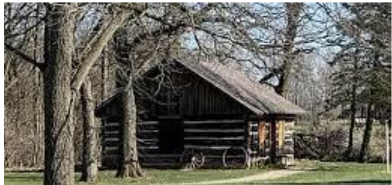
The log cabin was dedicated 25 years ago at the Historical Village. This will be celebrated at an open house in July.