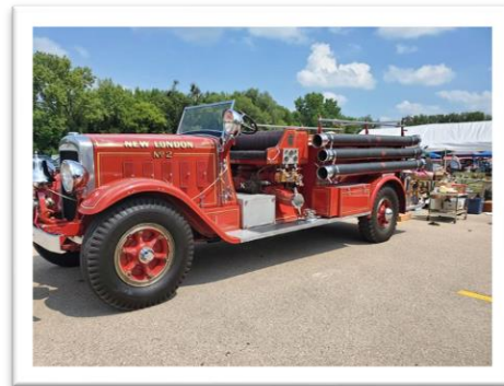
1934 Fire Truck at Rail Fest