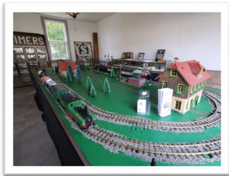
G-Scale railroad display by the Sheboygan Railroad Museum

The annual Heritage Day & Rail Fest was held at the historical Village on August 5th. There was a variety of activities for the whole family including vendors, concessions, music, games, train rides, and rummage sale. All of the buildings were open to tour and the Sheboygan Railroad Museum brought a G-Scale train model and set it up for display in the Simmon's Garage.